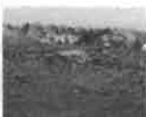
Victory at the mouth of the sword: Mount Hebron

We would all like to enjoy our talkback space. "Out of control" comments that are spared from polite company and are saved for the anonymity of the internet will be