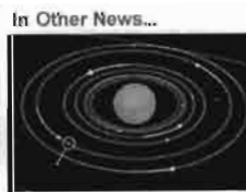
Scientist duo say they've found solar system's 9th planet

The giant planet orbits the sun at a very great distance, every