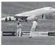
24 Captured Scenes That Could Never Be Caught Again Blahparazzi