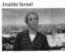
'I remember screaming - Nehemia!'

Prosecution reportedly discussing a plea bargain with lawyers for