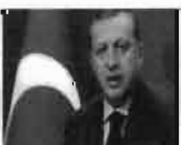
An Israeli gas pipeline to Turkey? Bad idea