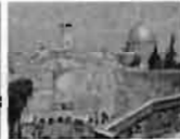
Why the Status Quo on the Temple Mount Needs to Change