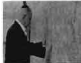
No, Netanyahu has not become a Holocaust denier