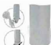
Pelican Shower Filter Replacement $$ - pelicanwater.com