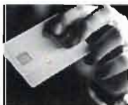
3 Banks Introduce New Cards Paying Unusually High Miles Per Dollar LendingTree