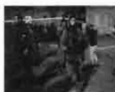
Don't just treat the symptoms