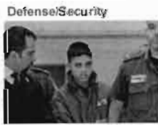
Plea bargain with teen terrorist being considered again

The giant planet orbits the sun at a very great distance, every