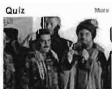
Who was Samir Kuntar?