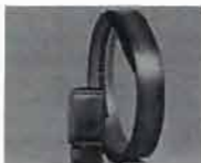
"Normal" Belts Are Going the Way of the Dinosaur. Here's Why. SlideBelts