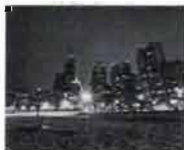
20 Most Beautiful Winter Cities Awesome Escape