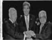
Shimon Peres to Israel: "Close Your Eyes"

We would all like to enjoy our talkback space. "Out of control" comments that are spared from polite company and are saved for the anonymity of the internet will be