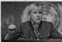
European liberal left leaves Europe in decay, Wallstrom-style Bany Shaw