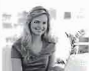
99% of Students Get Better Grades Using This Grammar App Grammarly